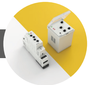
Monitoring / Protection Relays